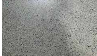
Salt & Pepper