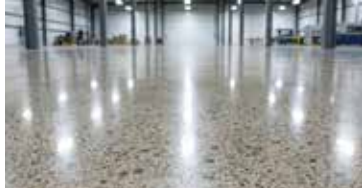
Level 3 – Semi-Gloss