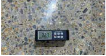
Level 2 – Satin