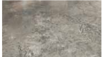
Cream / Nil